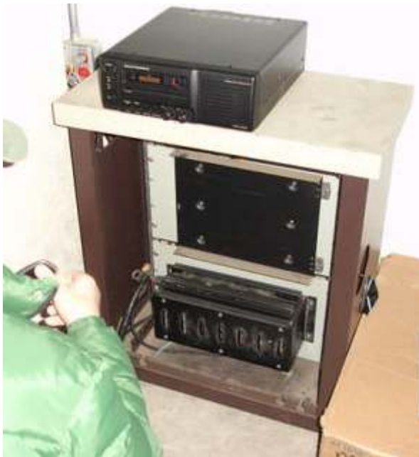
The 146.820 Vertex repeater installation at the VA.

Ontario County ARES/RACES will be placing a 440MHz repeater at City Hall in Geneva. They also hope to be able to place an APRS digipeater and a Winlink 2000 RMS station in the area. This will provide coverage to the East side of our County.